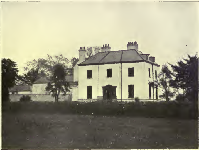
BELCAMP THE HOME OF THE GRATTANS